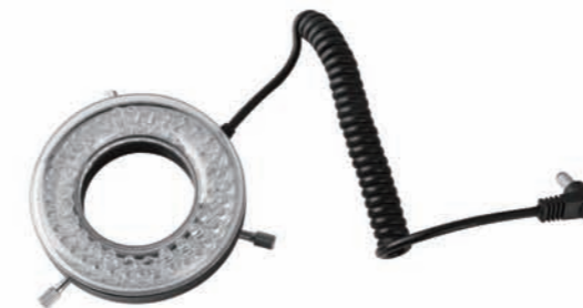
LED Ring Light