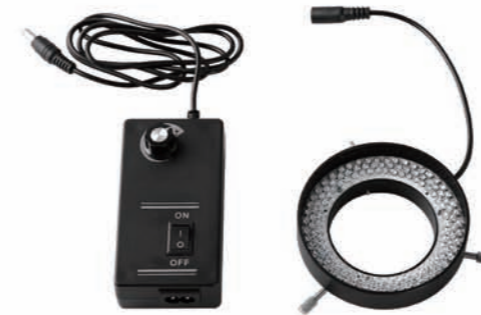
LED Ring Light