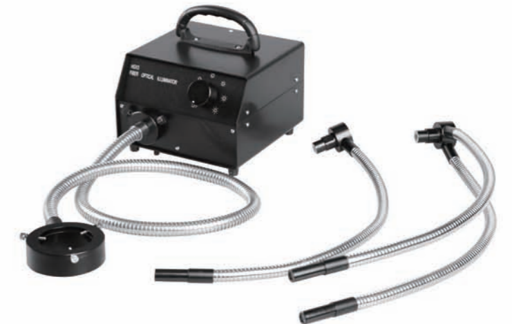
Cold Light Source