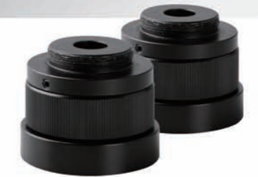
C Adaptor 0.4X